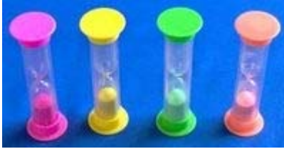
4 Minute Brushing Timers

Time yourself to make sure you are brushing for the correct amount of time