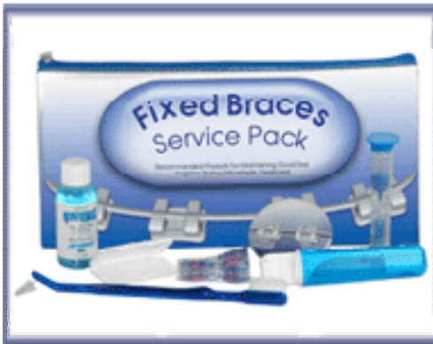
Fixed Brace Home Care Kit

Designed by an Orthodontist, the TOTALGARD™ sets new standards in Patient comfort and protection during contact sports. Superior to any other preformed mouth guard in both design and function. Available in Small, Medium and Large.