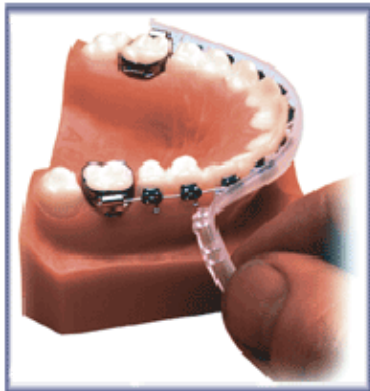
Comfi-Guard™ Lip Protector – Standard

Disclosing tablets highlight plaque when chewed. The red colour remaining on the teeth reveals areas overlooked when brushing or flossing (so you can get even better at proper oral hygiene).